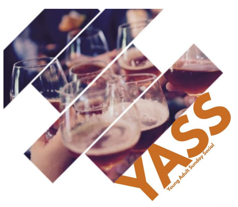
Earl's Beer & Cheese | 1259 Park Avenue | 2pm | January 14, 2018