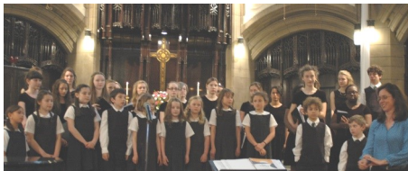
NEW YORK MIXED CHORUS, JUNE 19